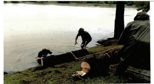
"CONTRACTORS REMOVING TREE FROM LAKE"

EMERGENCY PREPAREDNESS AT HCA DOES NOT APPLY ONLY TO OUR LAKES / DAMS, BUT TO AN OVERALL APPROACH TO PROTECT PROPERTY - EMPLOYEES - MEMBERS AND VISITORS. FOR EXAMPLE: WHEN A BOIL WATER ADVISORY WAS ISSUED BY THE CITY OF COLUMBIA, HCA TOOK THE PROTECTIVE STEPS TO CLOSE THE COMMUNITY CENTER, RATHER THAN RISK THE POSSIBILITY OF WATER BORNE DISEASES BEING CONTACTED THRU SHOWERS, BATHROOM FACILITIES OR DRINKING FOUNTAINS.